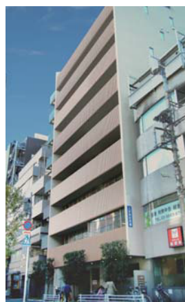
Complete View of Complex Building