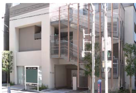
Complete View of Bicycle Parking Building