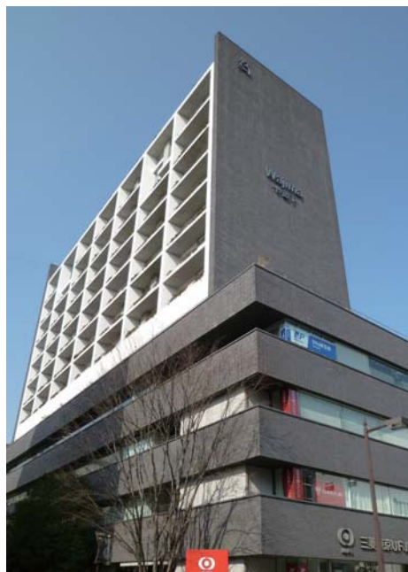
Complete view of building