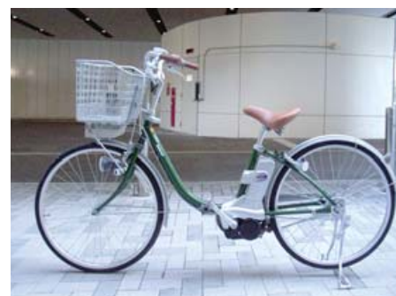
Electric assist bicycle compatible with automatic charging system

Underground parking lot for 144 bicycles. Charging devices are installed in the upper two floors of the eight-storey structure, providing a facility for automatically recharging electric assist bicycles while they are parked. The glass-panelled entrance booth allows users to watch their cycle being lowered, rotated and raised by the system.