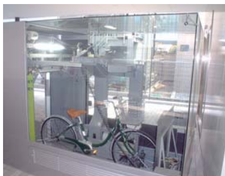
Side of booth with glass panelling