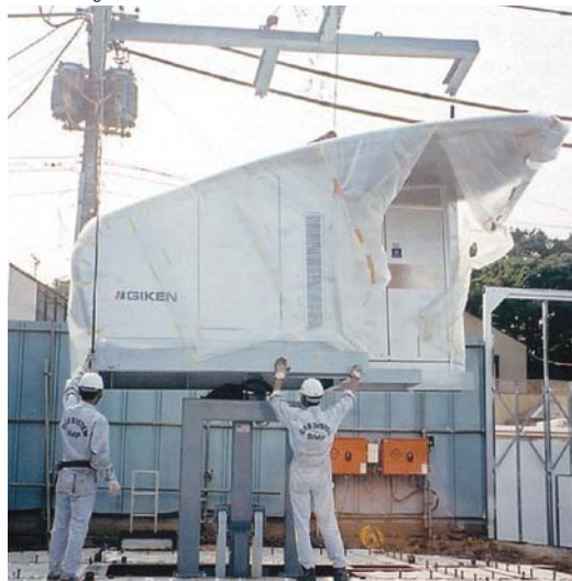
Installation of the entrance booth